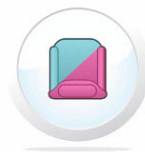
good but beware