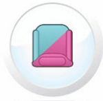
good but beware