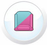
good but beware