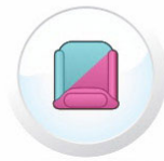
good but beware